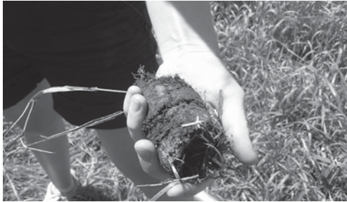
A BACE researcher takes a fresh soil core sample

The increase in prices and food shortages is attributed to rising energy prices, speculation on commodity crops, shortages due to a growing number of climate disasters, and the increasing use of food crops for biofuels. Over the past two years, tens of thousands of US farmers have switched from food to fuel production to reduce US dependence on foreign oil. Spurred along by generous subsidies, the US has transferred over 20