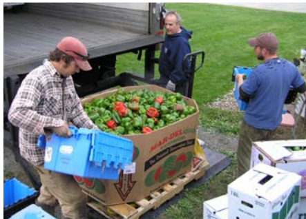
Above: 2,000 lbs. of bell peppers make their way from the fall fields to The Greater Boston Food Bank.

Farm-to-School and Healthy Waltham Nutrition Education Initiatives: Partnerships with the Waltham Public Schools Food Service Dept. and Healthy Waltham continued with produce from our farm supplying the Vegetable of the Month in school meals from September through November, as well as supplying after school and summer cooking/nutrition education programs, demonstrations and tastings at public events, and meals for the Waltham Family School and several other low-income community groups.