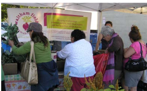
Below: Participants at the Outreach Market choose their vegetables. A highlight of the season was the kale cooking demonstration which led to a child loving the recipe so much she got in line and asked our farmer, “Which greens are the ones I just tasted?”